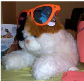
Who will win our mascot this summer?